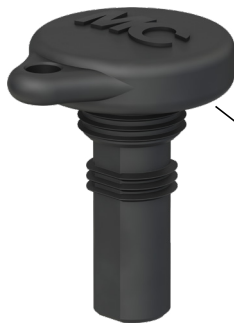
公电缆连接器用保护帽 Sealing cap for male cable coupler