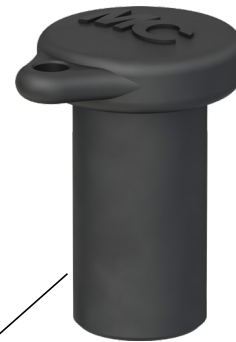
母电缆连接器用保护帽 Sealing cap for female cable coupler